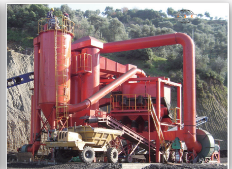
60 tph FGX Plant