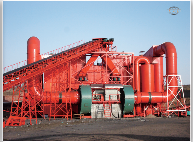
480 tph FGX Plant