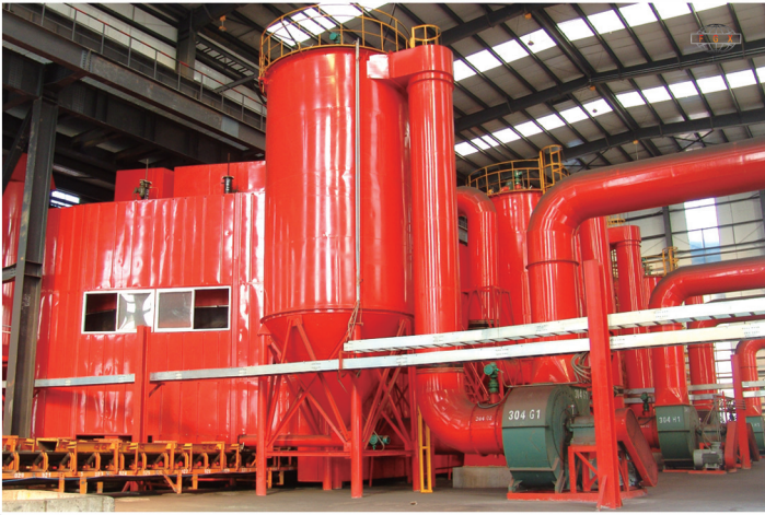
1400 tph FGX Plant (Shenhua Energy)