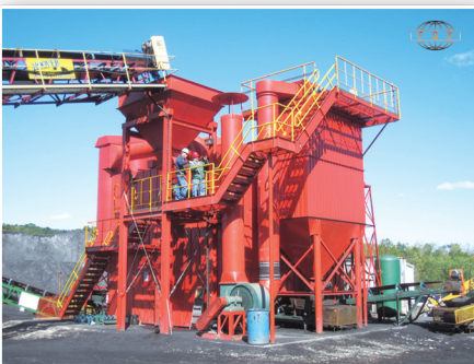
120 tph FGX Plant