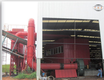
90 tph FGX Plant