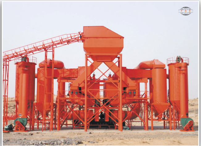
180 tph FGX Plant