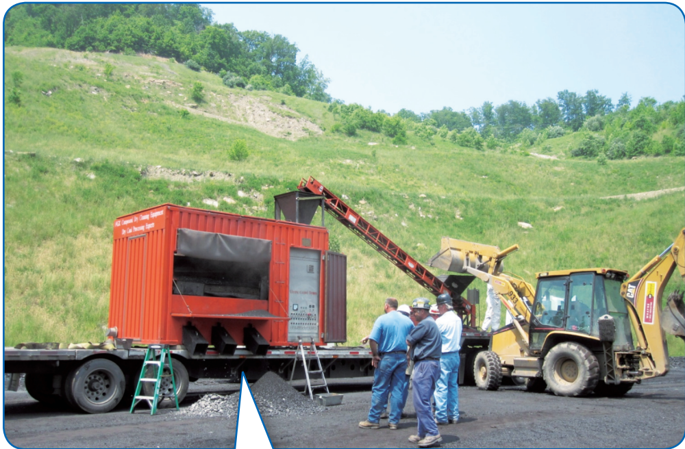
Seeing Is Believing...

Please provide us with the particle size analysis and washability information of your coal, and we will inform you if dry coal processing is suitable for your application. We can also bring our mobile pilot-scale test unit to your site to run your coal.