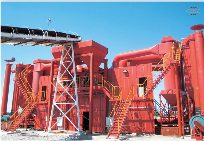
240 tph FGX Plant